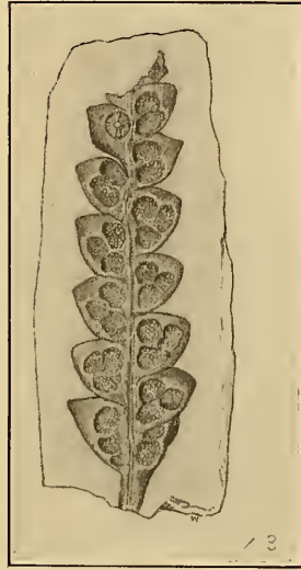
FIG. 3. Dryopteris Lloydii , fertile pinnule, \times 3 .

species has a more or less remote resemblance to several living species, but so little is known of its whole form that it would be perhaps misleading to signal any one for direct comparison.